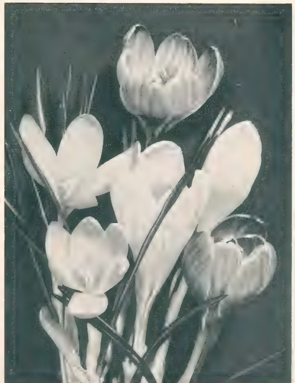
Crocus from Our Mammoth Bulbs